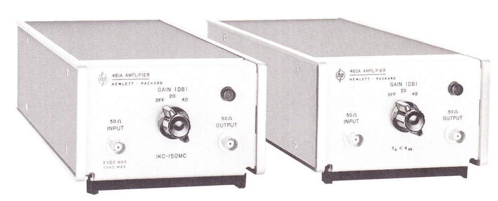
HP Model 461A